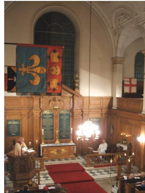
The Rt Revd & Rt Hon Dr Richard Chartres, Bishop of London, preaching the sermon