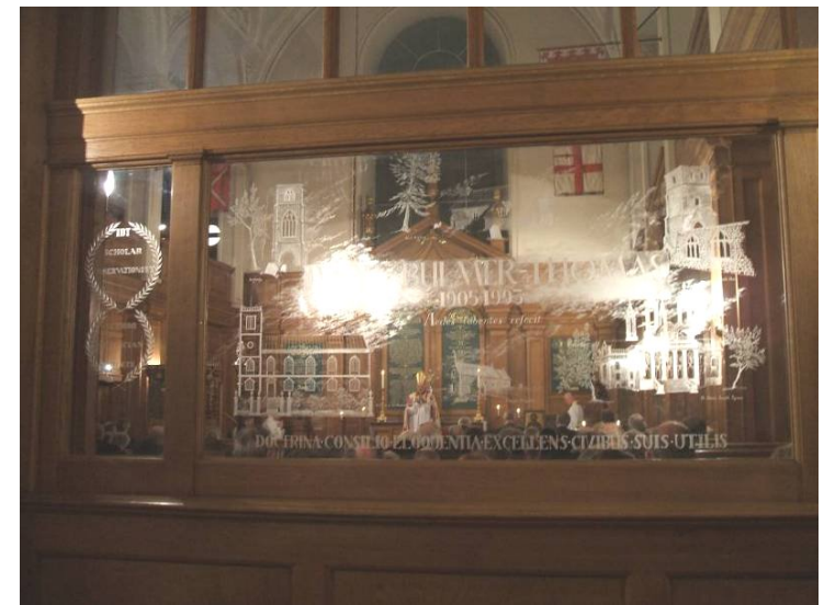
The Bishop of London giving the Blessing, seen through the memorial window in the narthex dedicated to Sir Ivor Bulmer Thomas, who masterminded the reconstruction of the church after the war. The detailed etching of St Andrew-by-the-Wardrobe can be seen.