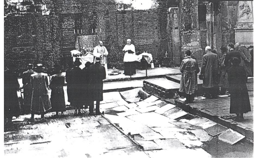
A service in the bombed out church

The church received a direct hit through the roof of the nave. Miraculously Sir Christopher Wren's outside walls and tower survived.