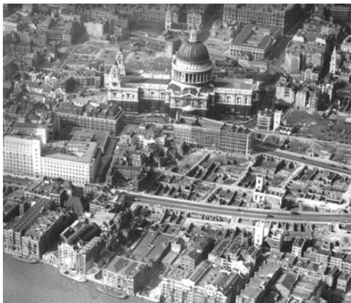
War damage in the vicinity of St Paul's Cathedral Unluckily, St Andrew-by-the-Wardrobe is a few yards off the left side of the photo. The bombed-out shell of St Nicholas Cole Abbey along Queen Victoria Street can be clearly seen