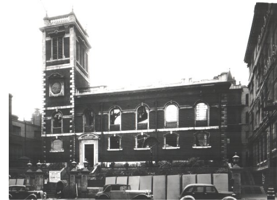
The church without its roof