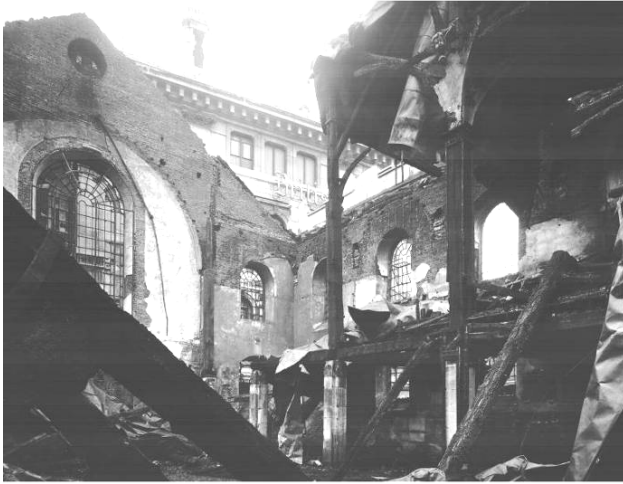
The gutted church of St Andrew-by-the-Wardrobe after being hit by an incendiary bomb during the Blitz

70th anniversary of the bombing of St Andrew-by-the-Wardrobe in the most spectacular attack of the Blitz during the night of 29/30th December 1940