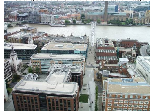
St Nicholas Cole Abbey, St Mary's Somerset and St Benet's

How rise thy towers, serene and bright, to meet the dawning day! (from the hymn 'City of God, how broad and far')