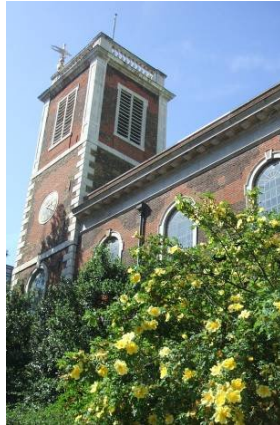
St Andrew-by-the-Wardrobe's churchyard