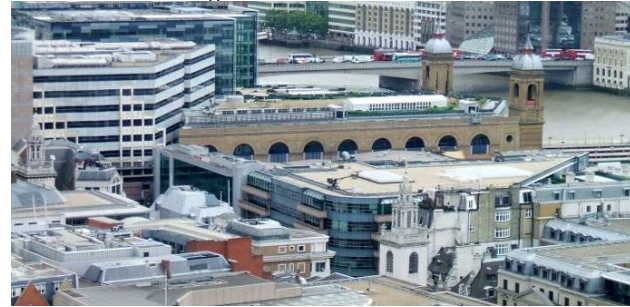
St Michael Paternoster Royal and St James Garlickhythe