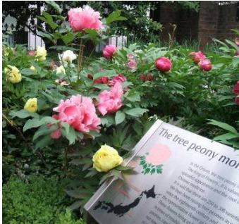
The stunning blooms of the tree peony monument, Cleary Gardens, near Mansion House Station